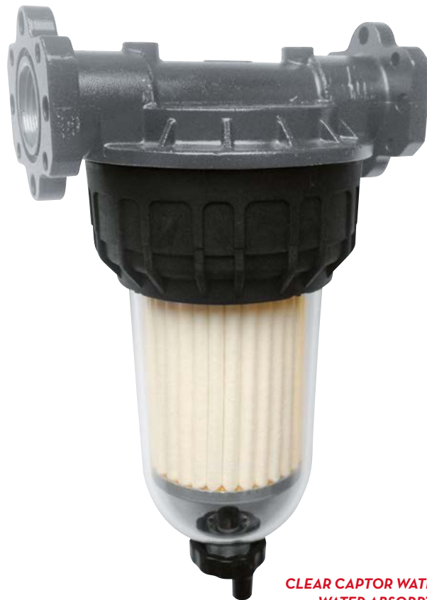
CLEAR CAPTOR WATER FILTER WATER ABSORPTION