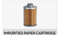
IMPURITIES PAPER CARTRIDGE