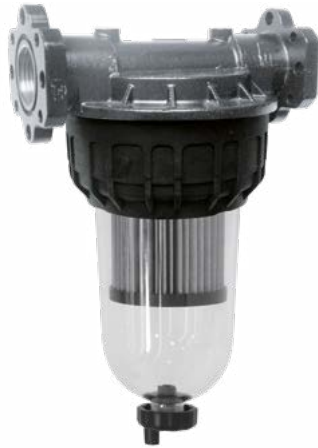
CLEAR CAPTOR FILTER STRAINER