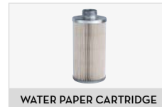
WATER PAPER CARTRIDGE