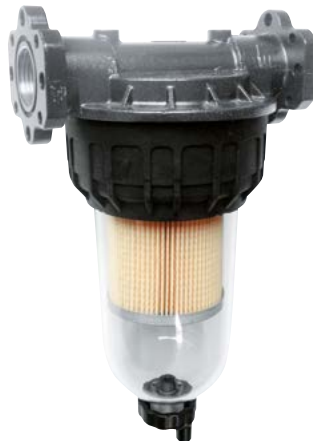
CLEAR CAPTOR FILTER 5 MICRON